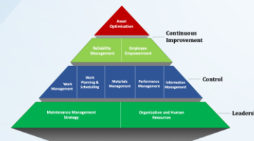
Maintenance Excellence Pyramid